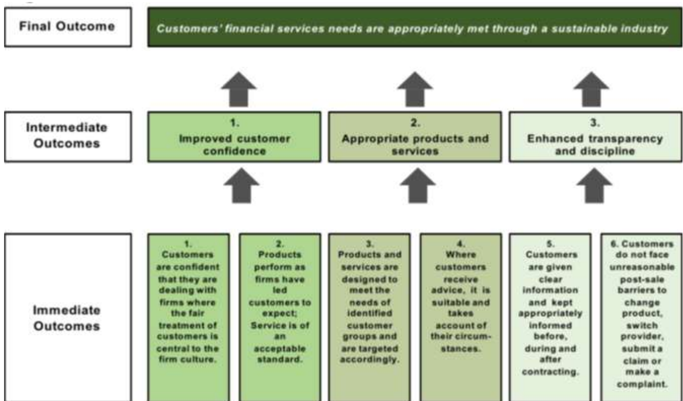
Figure 1 Regulatory Framework

We have set out below how we aim to ensure these principles are embedded in our approach and culture to dealing with our clients